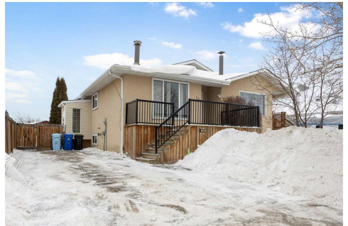
164 Wolverine Dr, Fort McMurray, AB

Cozy Up or Spread Out – Your Choice! The living room is bright, welcoming, and perfect for relaxing by the wood-burning fireplace on chilly Fort McMurray nights. Need more space? Head downstairs to the huge rec room™whether it™s a home theatre, a playroom, or your new workout zone, this space is ready to fit your lifestyle.