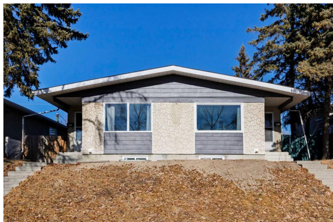
4214/4216 Dalhousie Dr NW, Calgary, AB

Main Floor Exterior Area 1907.65 sq ft Interior Area 1941.32 sq ft