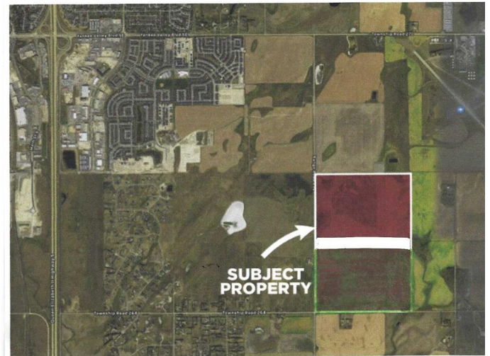
Balzac East Area Structure Plan

160 ACRES OR 64.7 HECTARES RAW LAND INSIDE BALZAC ANNEXATION. SOUTH EAST OF THE CITY OF AIRDRIE AND NEXT TO AIRDRIE AIRPORT. GREAT INVESTMENT LAND OR SUB-DIVISION POTENTIAL. East of Queen Elizabeth 11 Hwy - East on Township Road 270 - 1 km South on Range Road 292. South West of Airdrie Airport.- This land is extremely well situated to benefit from the expansion around it. With each major announcement, the land becomes more valuable. The MD of Rocky View has set records for development in an effort to meet strong real estate demand in the surrounding areas. Environmental Phase One & Site Plan completed